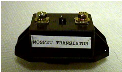
MOSFET MODULE POWER SEMICONDUCTOR DISSIPATION RATE >1 W 8541.29.00 HQ 084659