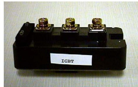
INSULATED GATE BIPOLAR TRANSISTOR MODULE (IGBT) DISSIPATION RATE > 1 W 8541.29.00 HQ 084659