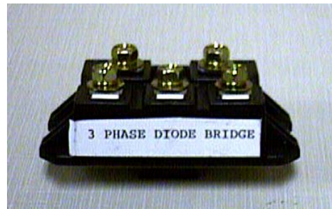
THREE PHASE DIODE BRIDGE 8541.10.00 HQ 958726 HQ 960323